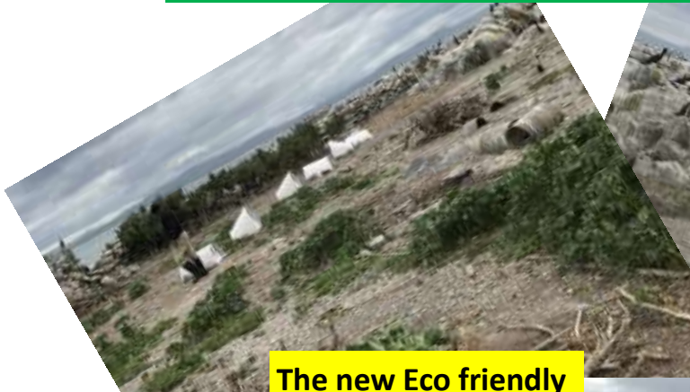
The new Eco friendly